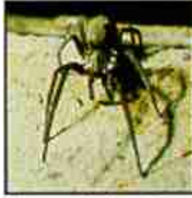
Figure 12. Southern house spider, Kukulcania hibernalis , female.