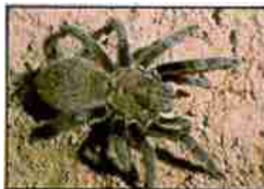
Figure 7. Tarantula, Aphonopelma .

Tarantulas in Texas are members of the hairy mygalomorph family in the genus Aphonopelma . These large, hairy spiders are brown to black and more than 3 inches long when full-grown. Females, larger than males, have abdomens about the size of a quarter.