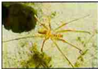
Figure 13. Southern house spider, Kukulcania hibernalis , male.