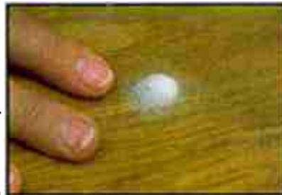
Figure 4. Brown recluse spider egg case, Loxosceles reclusa .

Sometimes hardly noticed at first, the bite later causes a stinging sensation that may include intense pain. Fever, chills, nausea, weakness, restlessness and/or joint pain occur within 24 to 36 hours. The bite also produces a small blister surrounded by a large congested and swollen area. The venom usually kills the affected tissue, which gradually sloughs away and exposes underlying tissues. The edges around the wound thicken, while the exposed center fills with dense scar tissue. Healing may take six to eight weeks, often leaving a scar, depending on the amount of venom injected and the reaction of the individual.