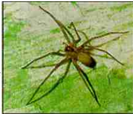
Figure 1. Brown recluse spider, Loxosceles reclusa .

Five species of recluse spiders have been recorded in Texas: Loxosceles apachae , L. blanda , L. devia , L. reclusa and L. rufescens . Although only L. reclusa and L. rufescens have been recorded as venomous to people, it is best to consider all these species as potentially