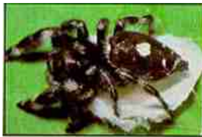
Figure 8. Bold Jumper, Phidippus audax .

Jumping spiders, all of which are in the family Salticidae, are among the most interesting spider groups to watch. Jumping spiders come in many sizes and color patterns. Active hunters during the day, they have good eyesight, relying primarily on movement to