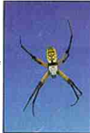
Figure 10. Yellow garden spider, Argiope aurantia .

Orb-weaving spiders produce the familiar flat, ornate, circular webs usually associated with spiders. Orbweavers come in many shapes and sizes, but the brightly colored garden orbweavers, Argiope , are the largest and best-known. The yellow garden spider, Argiope aurantia , is marked with yellow, black, orange or silver. The female body is more than 1 inch long with much longer legs. It is also known as the black and yellow garden spider and sometimes the writing spider because of a thickened interwoven section in the web's center. Male Argiope , often less than 1/4