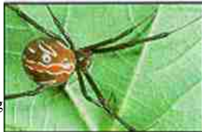
Figure 6. Southern black widow, Latrodectus mactans , immature.

Females lay eggs in a loosely woven cup of silk. The 1/2-inch-long oval egg sacs hold from 25 to 900 or more eggs, which incubate for about 20 days, depending on temperature and time of year. Spiderlings usually stay near the egg sac for a few days after they emerge, when cannibalism is prevalent. Surviving spiderlings disperse by “ballooning.”