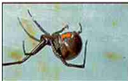
Figure 5. Southern black widow, Latrodectus mactans .