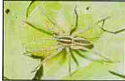
Figure 9. Wolf spider, Rabidosa rabida .

Wolf spiders hunt at night. Usually brown and black, they may have longitudinal stripes. Wolf spiders are large and often seen under lights. They can be seen at night when their eyes reflect light from a flashlight, headlamp or car headlight.