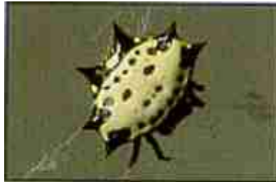
Figure 11. Spinybacked orbweaver, Gasteracantha cancriformis .

Orbweavers are generally harmless but can be a nuisance when they build large webs in places inconvenient for humans.