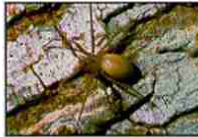
Figure 2. Brown recluse spider, Loxosceles reclusa , well-fed female.

As their name implies, recluse spiders are generally shy. They spin nondescript white or grayish webs, where they may hide during the day. They are predators of insects and other arthropods, known to wander around houses looking for prey. While walking, their body and legs together cover an area about the size of a quarter or half-dollar, but the body itself is only 1/4 to 1/2 inch long. Their color varies from orange-yellow to dark brown.