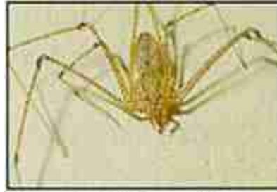
Figure 3. Spitting spider, Scytodes .

One other group of spiders, the spitting spiders, Scytodes , has a similar eye arrangement. A spitting spider has long, spindly, banded legs and a spotted pattern on its cephalothorax, the front body region. The cephalothorax is raised in spitting spiders but nearly flat in recluse spiders. Slow-moving, spitting spiders are common in window sills and considered harmless.